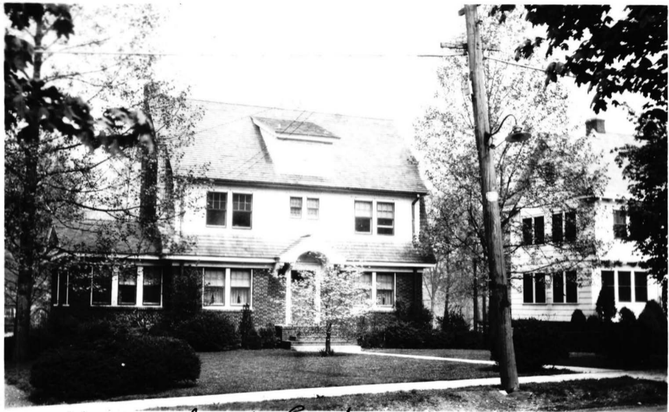
11 Woodland Road