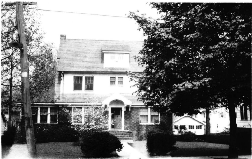
11 Woodland Rd., Melrod.